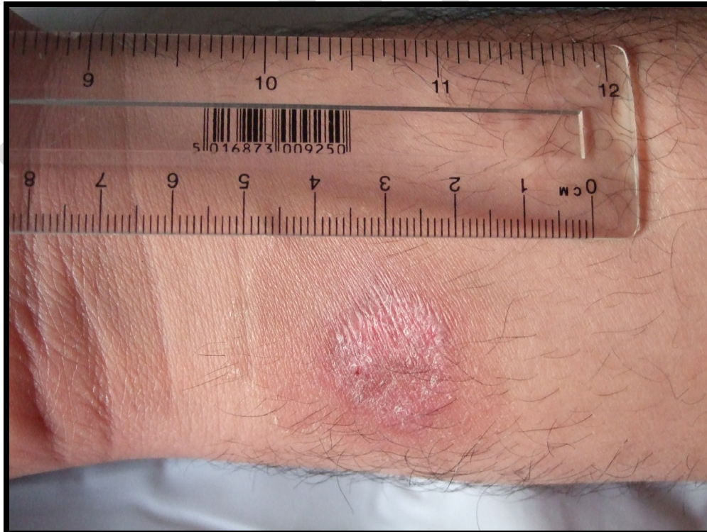
Figure 2 An annular slightly erythematous rash with crust on the surface